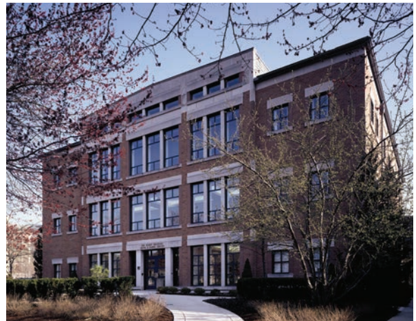
The Family Institute has become a premier center for innovative research, including the development of the STIC®.